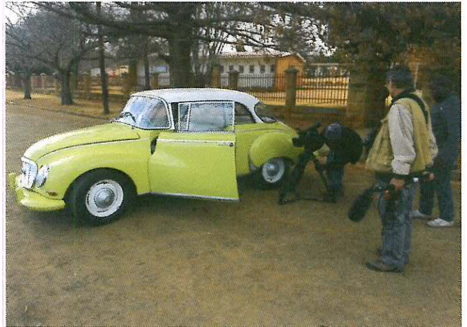
The TV crew busy filming Luame's DKW

The route started at the casino and followed the N5 through Bethlehem until it swayed left towards Fouriesburg. Along the route members had to look for route markers and had to regulate their speed to pass these routemarkers at given times. Points were given for each second to late or early. The team with the least amount of points were declared the winner.